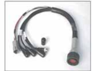
TAILGATE ADAPTER #29059