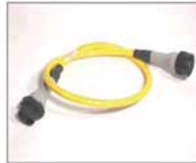
BB EXTENSION CABLE #29089