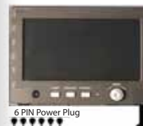
CAMERA & A/V INTERFACE HARNESS

Port "A" Camera In 6PminiDIN Port "B" Camera In 6PminiDIN Port "C" Camera In 6PminiDIN Port "R" Camera In 6PminiDIN