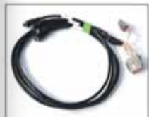
CAB ADAPTER # 29086

Non-proprietary connectors provide easy access and economical connectivity for advanced video, radar sensors and digital information technologies.