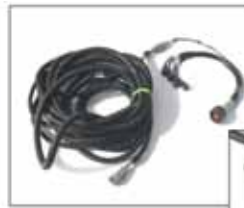
EXT CABLE #29073